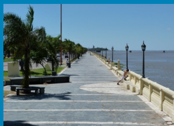
West Coastal Walk

The Organizing Committee of SAP2015 invites institutions and companies to participate of this forum to disseminate their products, activities, technologies and / or services. For inquiries, please contact: sap2015@santafe-conicet.gov.ar .