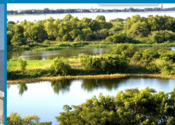
Ecological Reserve, East Coastal